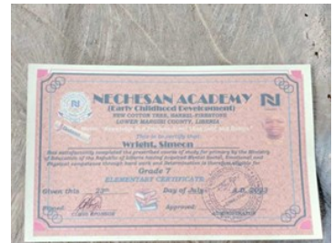
(These are documents for Danlett showing her accomplishments.)